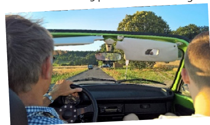
With the guest father in a green Volkswagen Beetle

Whether indoors or outdoors, there are plenty of fun activities available, and you and your child can pick them in advance or upon arrival in Germany. Some highlights are a visit to a falconry, a walk in the wildernis on a treetop path from which wolves can be sighted, visits of caves in the area, segway rides, go-karting, or horseback riding. Special activities are often offered on the weekends, and these can be booked in advance on the enrollment form.