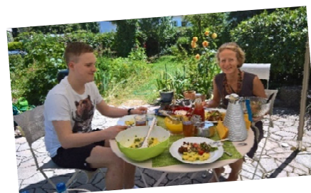
Having lunch with his teacher at home