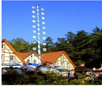
Beer-garden in Reckendorf in the countryside

You will have your meals together with the teacher, at home, in a restaurant in town or in the countryside. The teachers are dedicated cooks and know how to prepare international and vegetarian dishes. They can also consider special dietary needs.